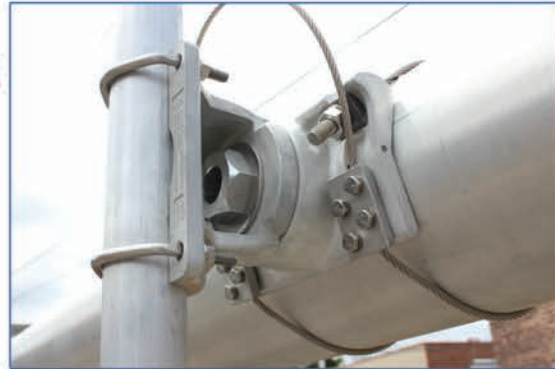
Rigid Mast Arm Clamp - Cable Type