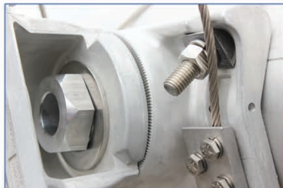
Close-up of Serrated Teeth