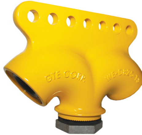
WE - D825 - T