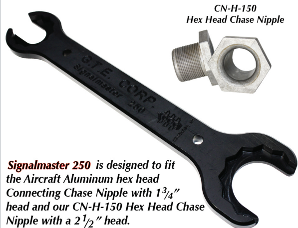
CN-H-150 Hex Head Chase Nipple

Signalmaster 250 is designed to fit the Aircraft Aluminum hex head Connecting Chase Nipple with 1 3/4" head and our CN-H-150 Hex Head Chase Nipple with a 2 1/2" head.