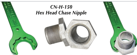
CN-H-150 Hex Head Chase Nipple

Signalmaster 225 is designed to fit our CN-175 Chase Nipple with a 2" head and our CN-H-150 Hex Head Chase Nipple with a 2 1/2" head.