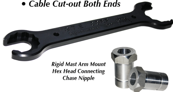
Rigid Mast Arm Mount Hex Head Connecting Chase Nipple