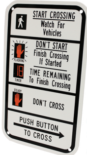
PS-915 9" X 15" Pedestrian Sign