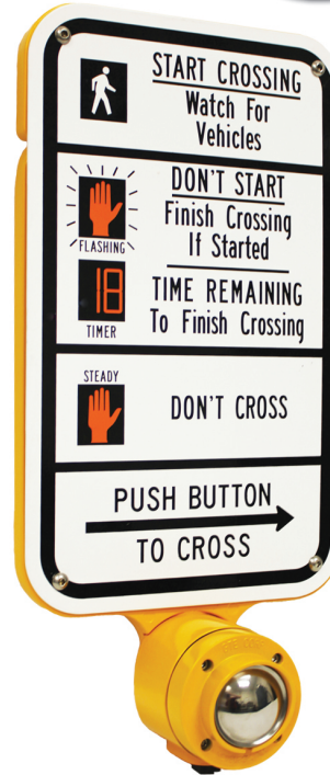
PBA - 1030ADA

The PBA-1030ADA was specifically designed to fit the 9" X 15" Pedestrian Signs. The extension piece is easily attached to the PBA - 1020-1 sign frame with use of guides and stainless steel hardware. The popular GTE Corp. PB-3-ADA-2 pedestrian pushbuttons are mounted to the sign frame and are easily removable, if desired. Adjustable pole guides allow adaptation to many different diameter poles.