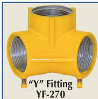
"Y" Fitting YF-270