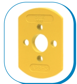
APB-3 Accessory Spacer Available

The General Traffic ADA Series Pedestrian Pushbuttons were designed to be in compliance with the "Americans with Disabilities Act". The pressure needed to actuate our pushbuttons is less than 4 lbs! The magnetically actuated, reed switch assembly is designed to give many years of trouble-free service. Find out how economical it is to put your city in compliance with the ADA law! Please ask us about our Pedestrian Signals with L.E.D.'s, and how they can start paying for themselves immediately!